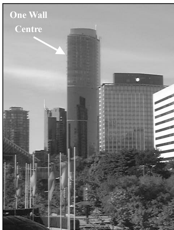
Figure 1. The One Wall Centre, looking South.

The study presented in this paper focuses on the One Wall Centre, a 48-storey building located in downtown Vancouver, British Columbia (Figure 1) [1]. The response of this building is of interest to structural engineers for a number of reasons. The structure is currently the highest building in Vancouver, and it is the only building in the region that makes use of tuned liquid column dampers to reduce vibrations due to wind. The main lateral load resisting system for the One Wall Centre is a reinforced concrete shear core with a unique shape, which makes the study of the dynamic response of the building very interesting. In addition, a good understanding of the seismic response of the building is important since Vancouver is located in one of the most active seismic regions of Canada.